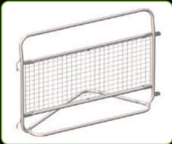
■ Police Barrier