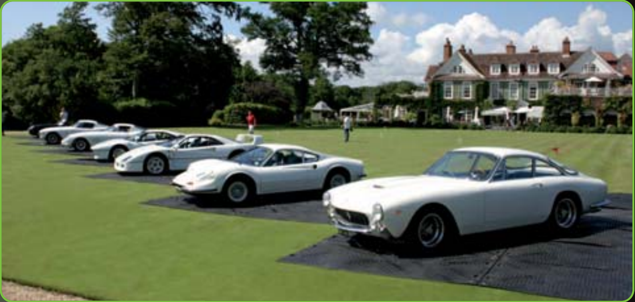
■ 2009 Chris Evans' Drivetime Magnificent Seven event in aid of Children in Need