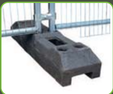
■ Thermo Plastic Foot