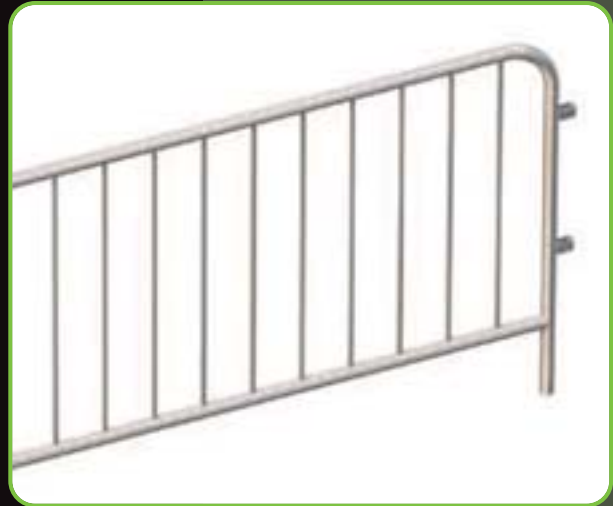
■ Bar Barrier