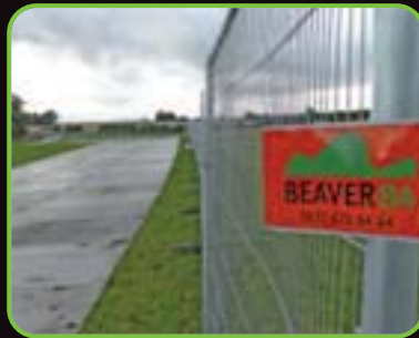
■ Towers and fencing panels at Glastonbury 2009