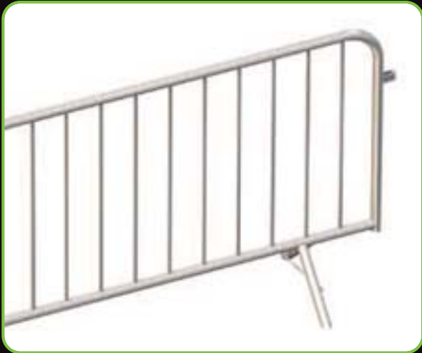
■ Reinforced Fixed Leg Barrier