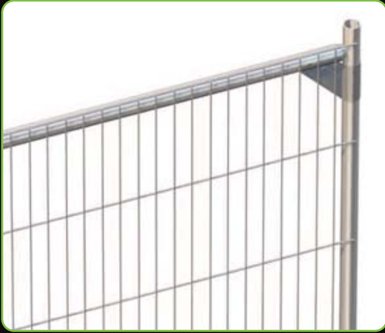
■ Heavy Duty Beaver Web Panel